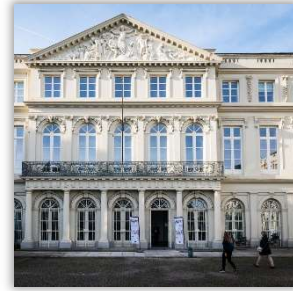
Place du Musée - Entrance to the Conference center

It is easily accessible by public transport: