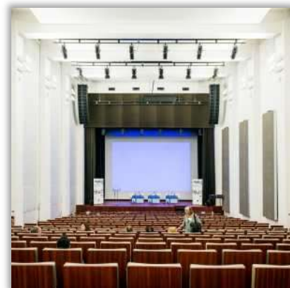
© Creative Commons - Auditorium 490