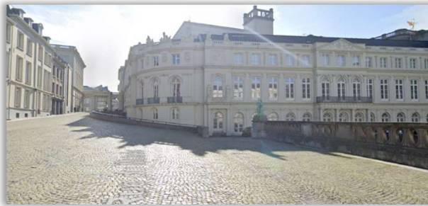
Rue du Musée

Please be aware that the entrance to the conference center is in a side street between the Royal Museums of Fine Arts and the Magritte Museum.