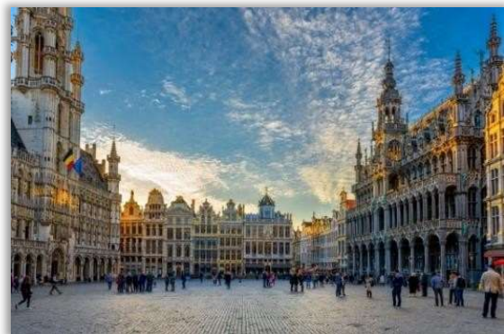
Grand place of Brussels