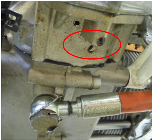
Figure 1: hole in ignition housing

The engine was sent to Franz Aircraft Engines Vertrieb GmbH, Germany for an investigation. A hole was found in the ignition housing under the water pump. When removing this housing, a damaged thrust washer of the idle/intermediate gear fell out. A tooth of the camshaft gear was missing and the water pump gear was also damaged. A metal part was found in the range of the circlip on the sprag clutch housing. Besides this, there was also damage on the pistons and the inlet valves.