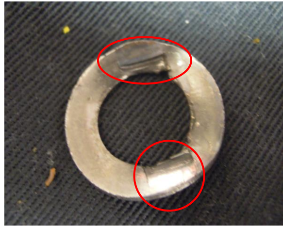
Figure 2: damaged thrust washer showing impact of gear teeth