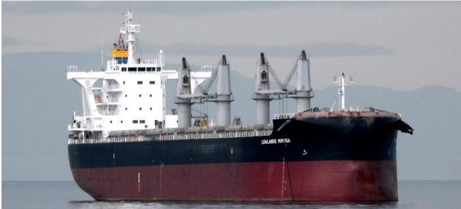
Figure 2 – Mv LOWLANDS MIMOSA